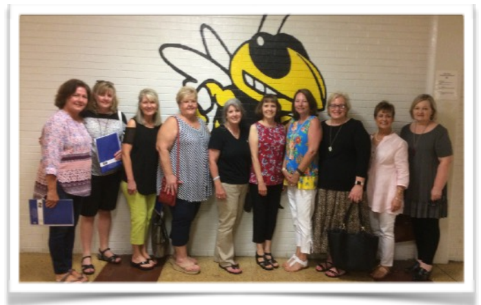
Starkville High School Class of 1973 Prayer Walk participants at our recent class reunion.

A high school class reunion is not the usual place for ministry, but I had the great honor of leading a prayer walk through the high school we attended 45 years ago. Your generosity provided a folder packed with educational materials on prayer for all the participants.