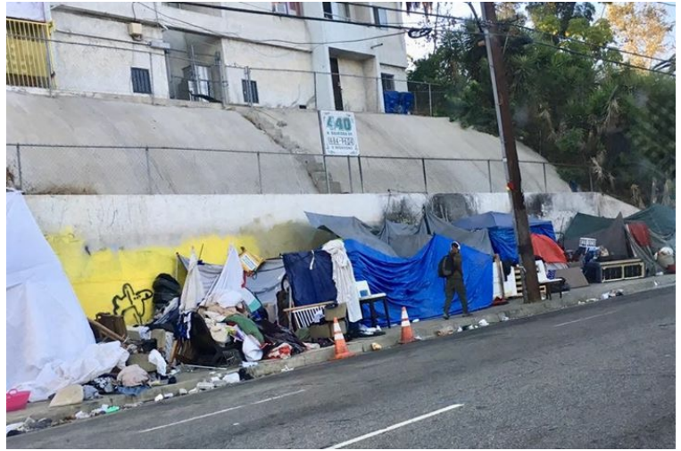
Homeless in Los Angeles

The transition from the Gala (left) to the long blocks of homelessness (right) was both shocking and sobering. 2,521 people call Skid Row home. More than 1/2 million people are currently experiencing homelessness in America. Drugs. Mental illness. Under-employed. The causes are myriad but we can help, and we must. We're working with area agencies to support the newly re-housed and help end homelessness in our area.