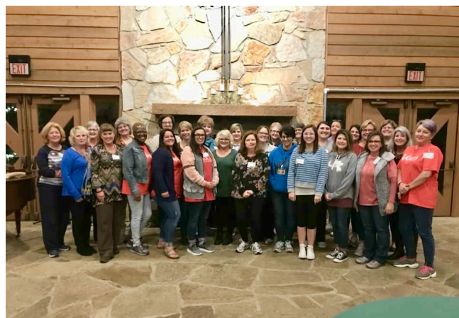
Whisper Gathering 2018