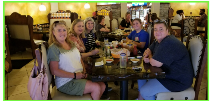
We shared a meal (and lots of laughter) after their hard work.

Interested in serving Jesus? Need community service hours? We can help. Our Whisper Connection group does more than study Scripture. They put what they learn into action. These ladies (at right) spent a recent morning sorting, counting, and organizing all the contents of our missionary housing—including every fork, knife, and spoon! One lady brought her granddaughter along to show her how to put faith into action and live out the Great Commission in our own communities every day. Contact me at lhollis@globaloutreach.org for information on service projects.