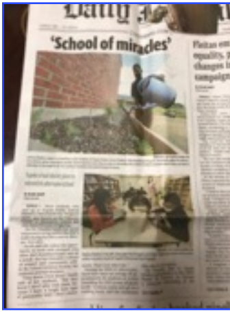
The Daily Journal recently featured our school with a front-page article.

“School of Miracles.” Those aren’t my words, but they could be. We’ve seen God move in so many ways at the Fillmore Center Structured Day Program (SDP). From a new, well-equipped library to a calming room and outdoor garden, God has changed the look and feel of SDP. Along the way, He’s changed hearts and lives, and we have the stories to prove it. You’ve prayed, given, and helped in tangible ways from cupcakes to luncheons for teachers to secret pals and more. The fruit of your labors is beautiful and life-giving.